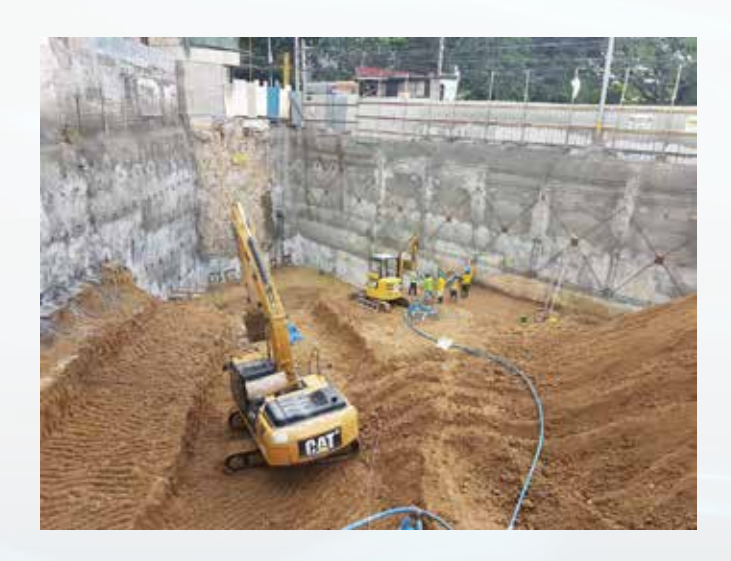
The Suites At Gorordo Marks Another Construction Milestone

Worldwide Central Properties Inc. celebrated the first concrete pouring of The Suites at Gorordo last July 6, 2019.